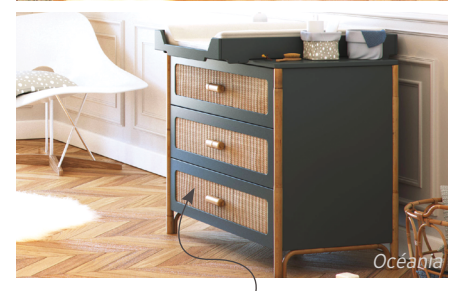
Panels in braided rattan