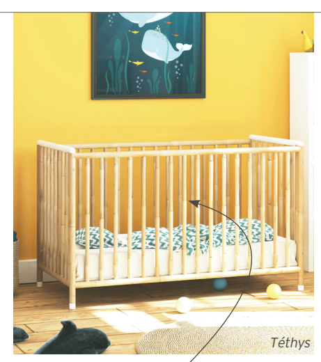
Bars in 100% rattan poles